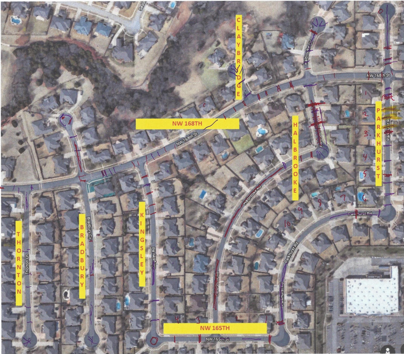
Saturday, September 19, 2020 9:01:19 AM - Google Earth